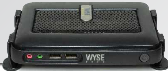
Image management and configuration can be automated via DHCP and fileserver for a 'hands-off' approach, while Wyse Device Manager provides complete 'hands-on' management of enterprise-wide devices.

Wyse ThinOS delivers a wealth of innovative, user-oriented and productive features: