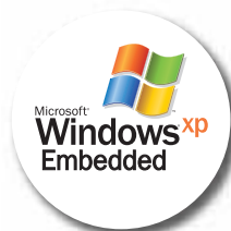
Microsoft Windows XP Embedded