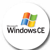
Microsoft Windows CE